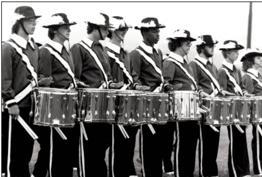
Watkins Glen Squires, 1978 (photo by Jim DeWitt from the collection of Drum Corps World).

Watkins Glen's Squires, founded by three dads whose purpose in doing so was "to keep the boys off the streets," achieved its goals and much more.