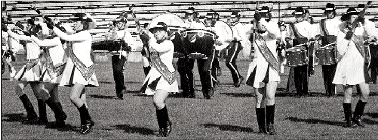
Watkins Glen Squires, 1976.

Much of the corps' success could be attributed to drill instructor Solon "Hardy"