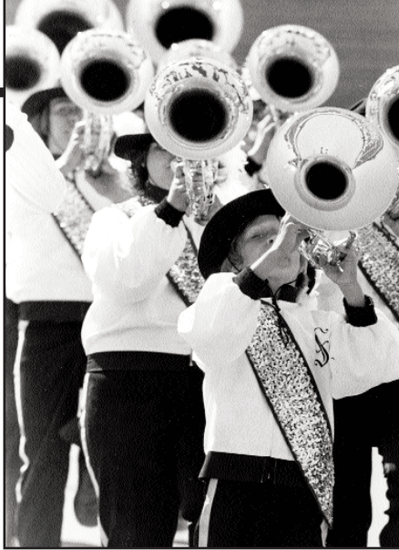
Watkins Glen Squires, 1974 (photo by Jane Boulen from the collection of Drum Corps World).

The corps also sponsored its first field competition, "Echoes in the Valley," at