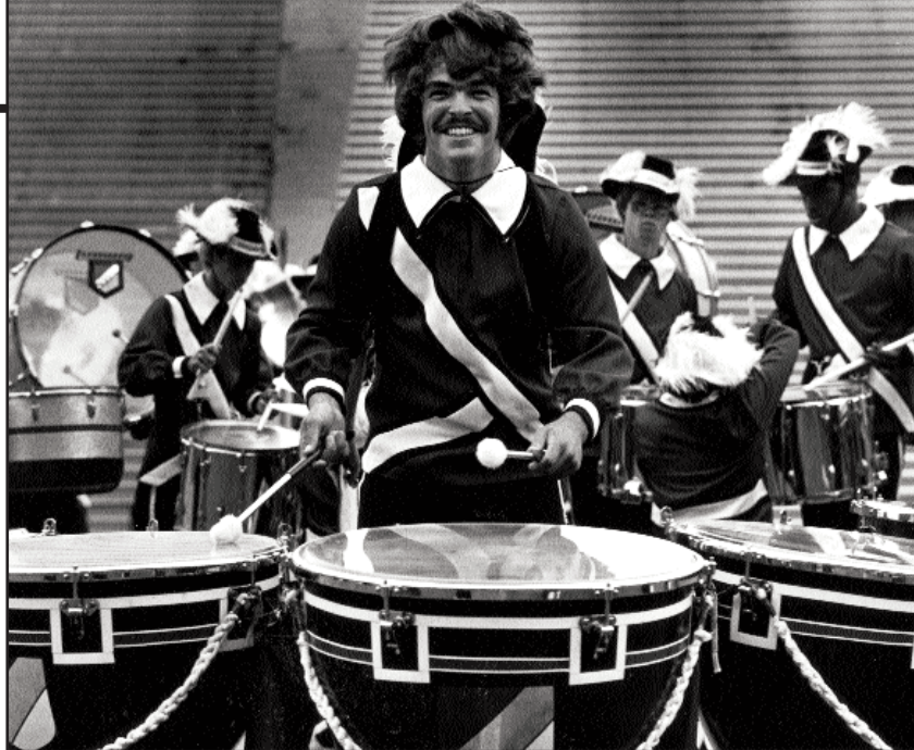
Watkins Glen Squires, 1977, at the DCI Championships in Boulder, CO, during prelims.

Spangled Banner and halftime for the Buffalo Bills at Rich Stadium. Earlier that summer, the National Anthem was filmed and used for the nighttime sign-off on television stations in Rochester and Elmira, NY.