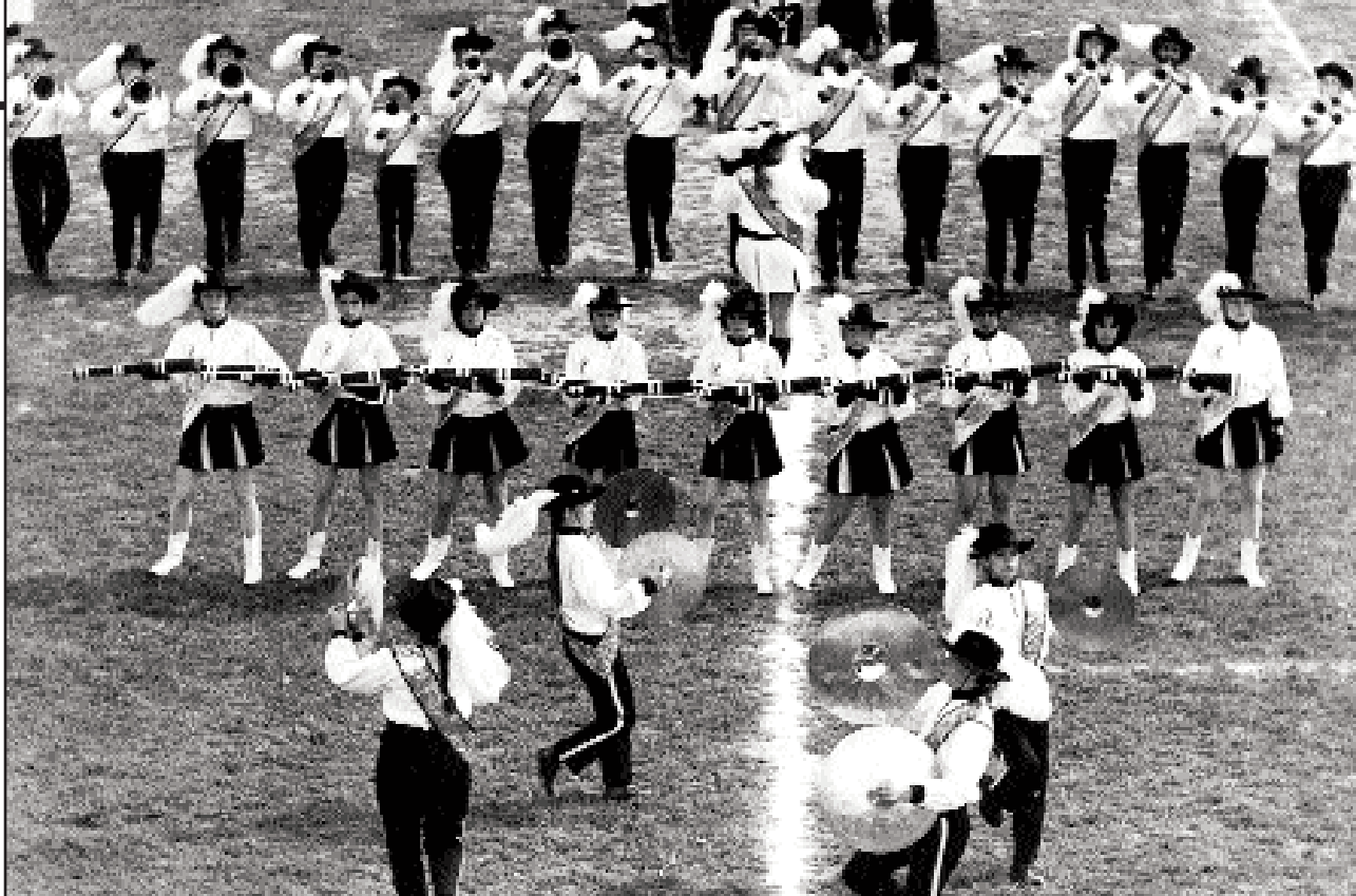
(Above) Watkins Glen Squires, 1974 (photo by Alan Winslow from the collection of Drum Corps World); (below) Watkins Glen Squires, approximately 1979, at DCI Canada in Hamilton, ONT (photo by Alan Winslow from the collection of Drum Corps World).

As an interesting anecdote and window to the times, with the annual tour just finished, most corps members were back at summer jobs. DCI required those members to take off another afternoon. The corps assembled at noon at