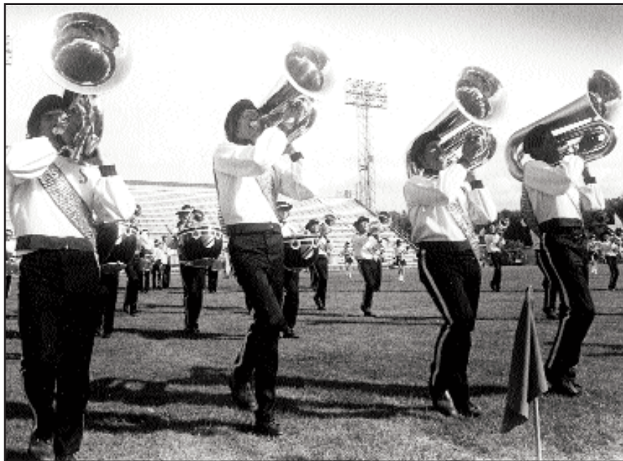
Watkins Glen Squires at a show in 1976.

Interestingly, the corps was unable to take part in two contests in July as "Summer Jam," the world's largest rock concert (to that time) brought over 600,000 people to the Glen. The state police closed all roads and, for three days, vehicular movement in and